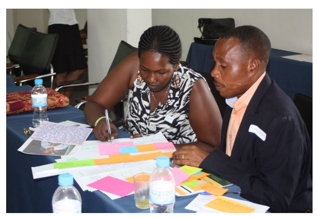
Stakeholders identify challenges to supporting refugee-survivors of SGBV who have a communication disability in Rwanda.