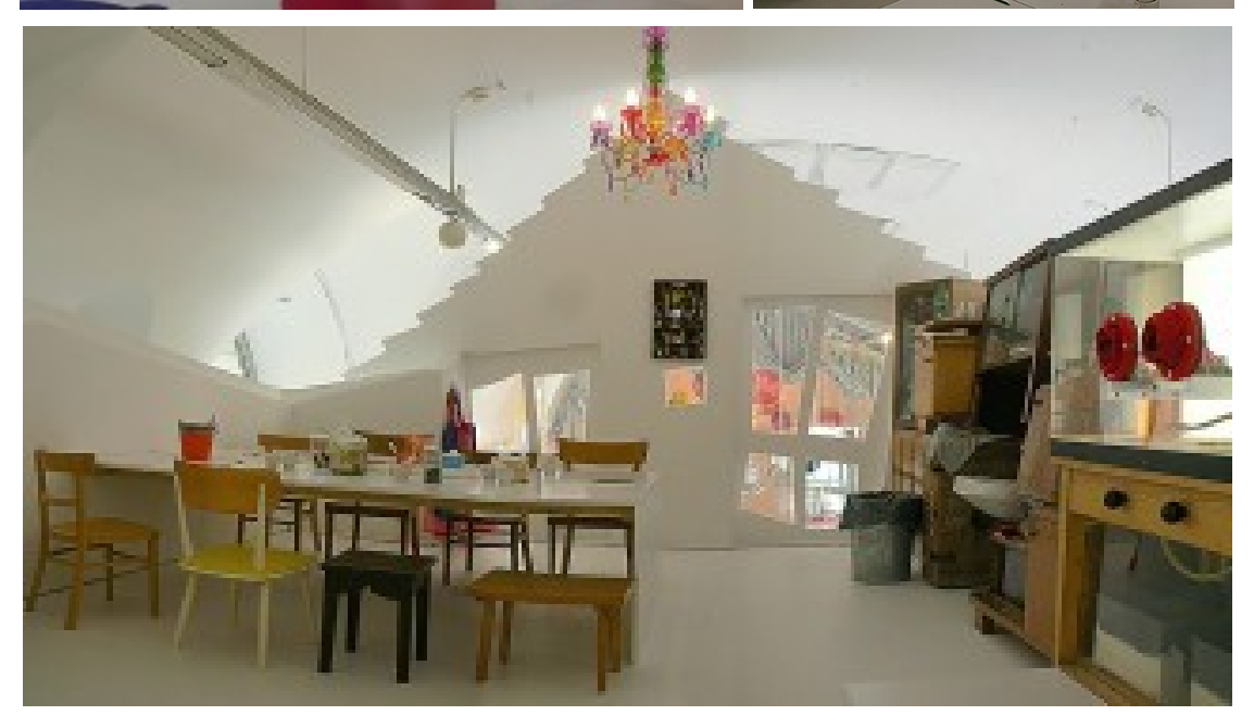
Figure 1 Views of the exterior and interior of the Mirakulosum Exhibit in ZOOM Children's Museum, Vienna (Wohrer and Harrasser 2011)